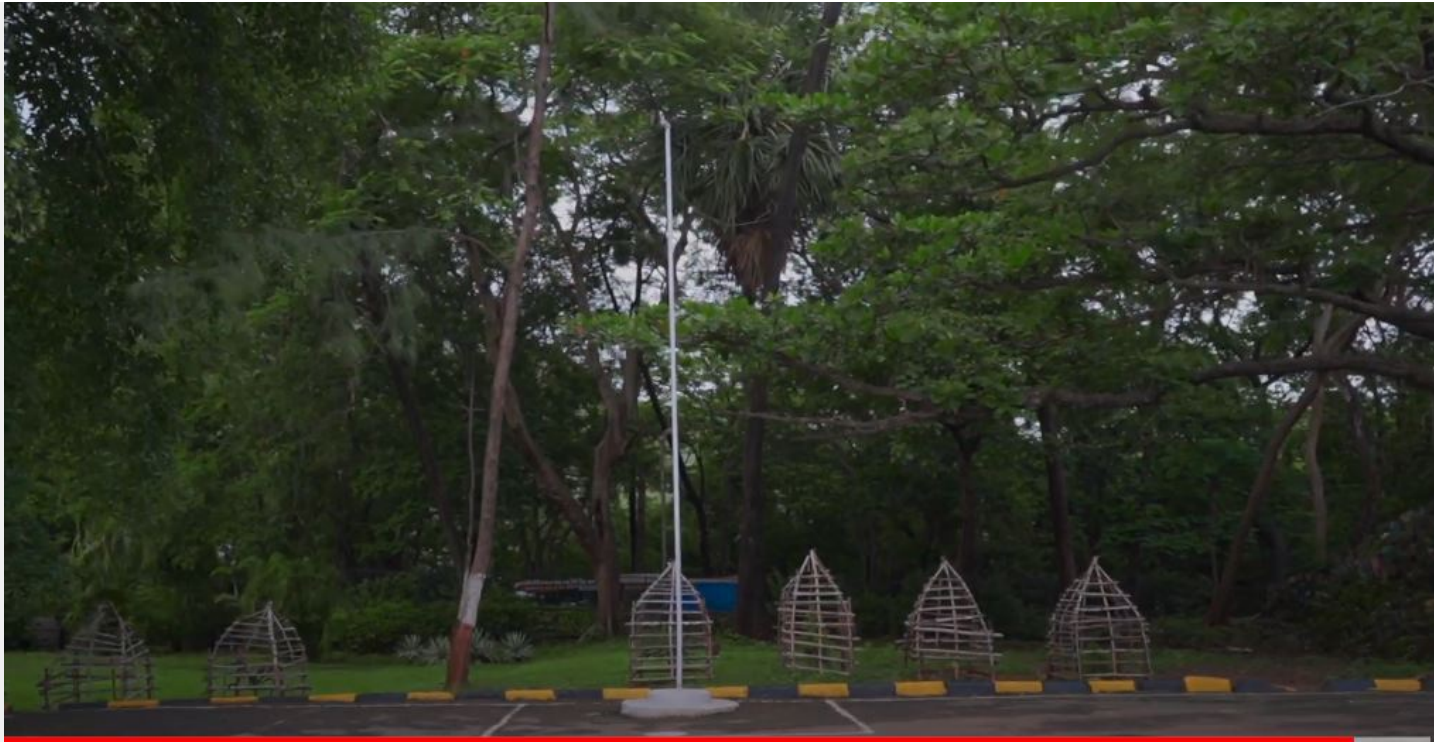
Flag Pole Road with Dome Pillar Corridor & Wooden Rest House